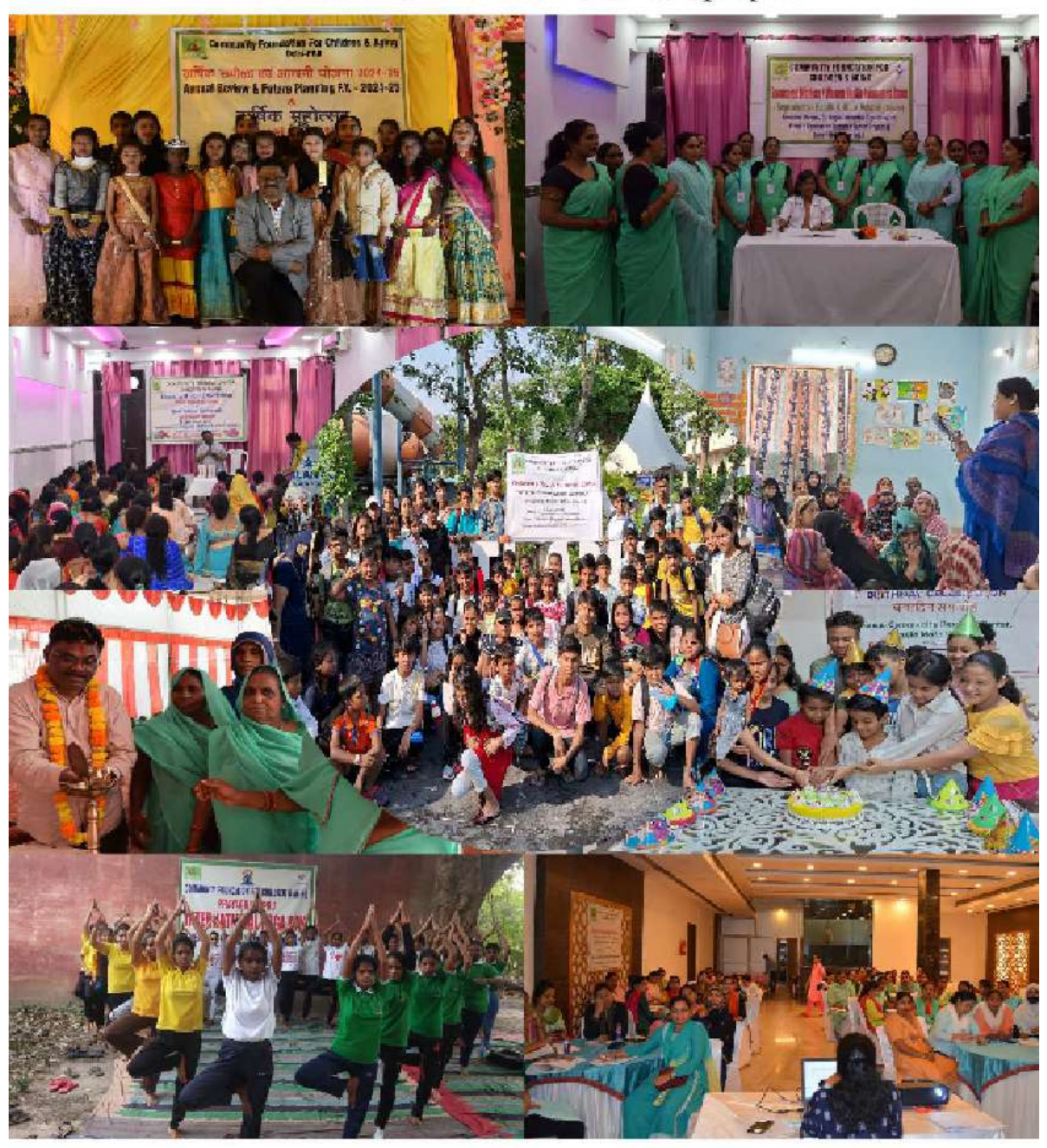
COMMUNITY FOUNDATION FOR CHILDREN AND AGING (CFCA)

"A commitment with dedication and purpose"