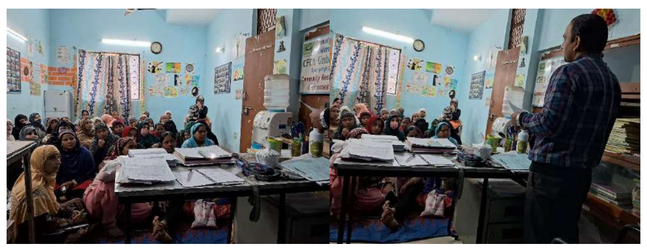
Health Awareness Camp- Mother's

Furthermore, mothers were advised on categorizing expenses to simplify record-keeping and were encouraged to prepare summaries of expenses for efficient management. Overall, the session aimed to empower mothers with essential financial literacy skills and equip them with the tools needed to ensure compliance and effective expense management.