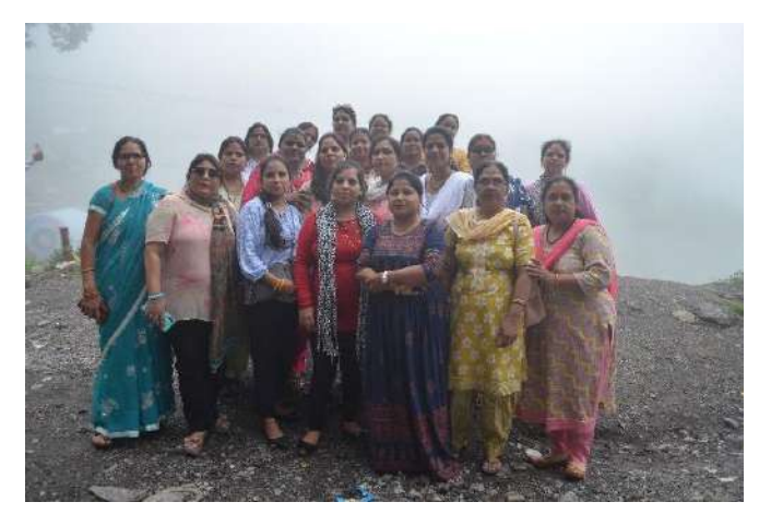
Children's Educational/Exposure Trip

Throughout the year, we organize two exposure trips for mothers across all subprojects to enhance their understanding of income generation programs and to familiarize them with organizations working for community welfare. These trips serve as invaluable opportunities for mothers to broaden their knowledge, gain new skills, and foster connections with like-minded individuals. By bringing together mothers from different subprojects under one roof, we facilitate collaborative learning and mutual support. During these trips, participants visit esteemed organizations such as Vimarsh Organisation Khurpatal, Jyoti Vikas, Jaipur, among others, where they engage in interactive sessions, learn about innovative initiatives, and exchange ideas with experienced professionals. These exposure trips not only empower mothers with practical insights and inspiration but also strengthen their role as change agents within their communities. Through collective efforts and shared experiences, we strive to create a brighter and more prosperous future for all.